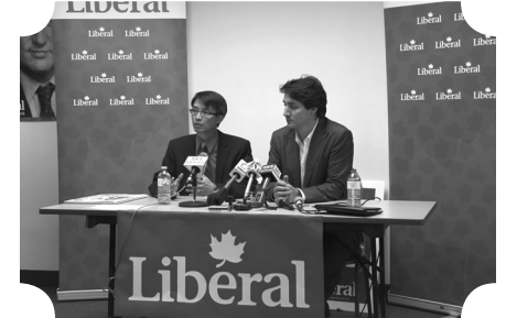
與自由黨領袖杜魯多一起主持傳媒招待會 With Liberal Leader Justin Trudeau hosting a press conference during 2014 by-election Campaign