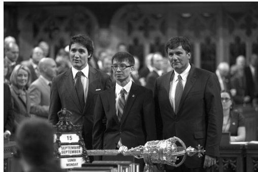
總理杜魯多及國會議員Dominic Leblanc 陪同首度步入國會

Taken into the House of Commons for the first time by Prime Minister Justin Trudeau and MP Dominic Leblanc