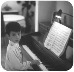
八歲大 At 8 years old