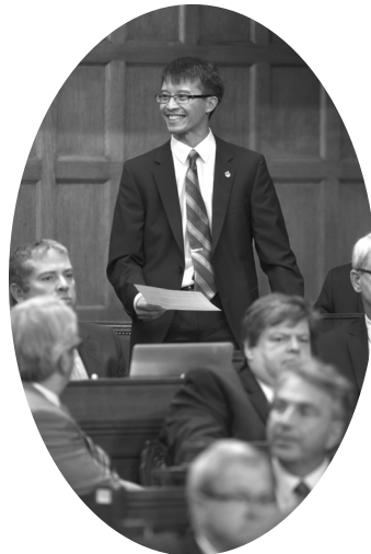
在國會演說 Speaking in the House of Commons

Taken into the House of Commons for the first time by Prime Minister Justin Trudeau and MP Dominic Leblanc