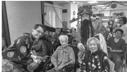
與士嘉堡愛靜閣長者一起慶祝農曆新年 Celebrating Chinese New Years with seniors in Scarborough—Agincourt