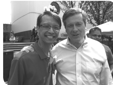
與市長莊德利參加士嘉堡社區活動 With Mayor John Tory at a local Scarborough event