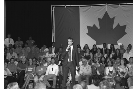
於2015大選活動介紹自由黨領袖杜魯多 Introducing Liberal Leader Justin Trudeau in 2015 General Election