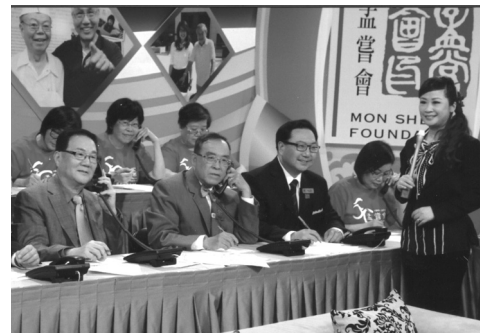
為孟嘗會電視籌款 Supporting Mon Sheong Foundation's Telethon