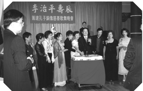
六十一歲壽辰為孔子像籌款 Fundraising for Confucius statue at his 61st birthday celebration