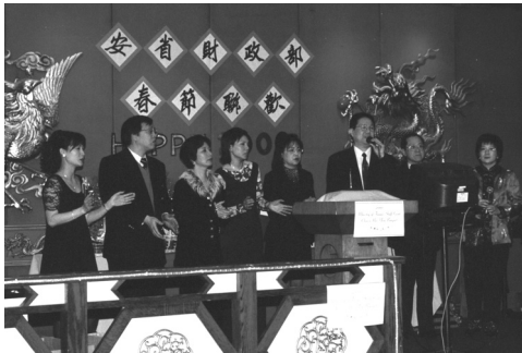
於安省財政部春節聯歡演出 Performing at Ministry of Finance Chinese New Year event