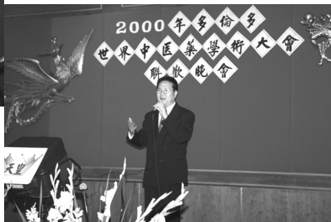
於世界中醫學術大會演出 Performing at World Chinese Medicine event