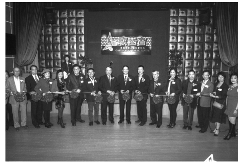
2008歌藝會成立晚會 2008 celebration of the founding of Popular Music Centre