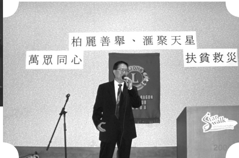
於柏麗獅子會義唱 Singing at Paragon Lion's charity event