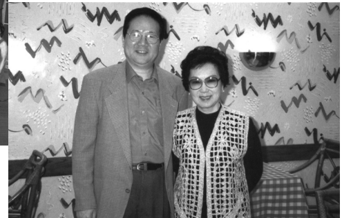
與天后吳鶯音合照 With singing superstar Wu Yingyin