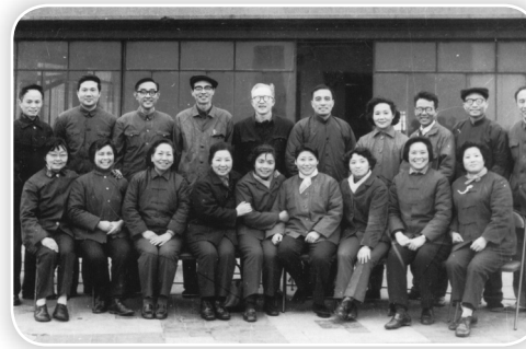
與上海電視台藝員合照 With the staff of Shanghai TV Station