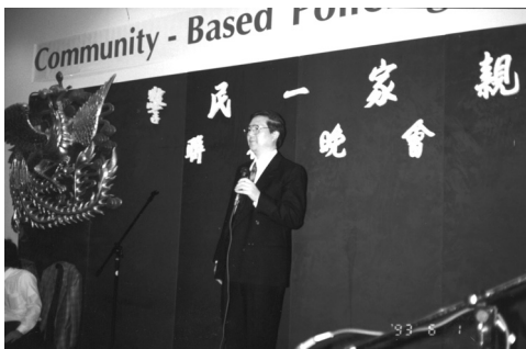
於警民一家親晚會義唱 Singing at Community Policing charity event