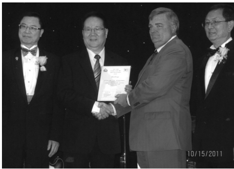
2011年獲扶輪社頒發四大考驗獎 Receiving "Four-Way Test" Award from the Rotary Club