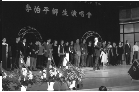
1996 第二次師生演唱會 1996 concert with students