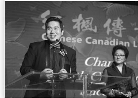
作為頒獎嘉賓出席2016年紅楓傳奇頒獎晚會 As presenter at CCLA Gala in 2016