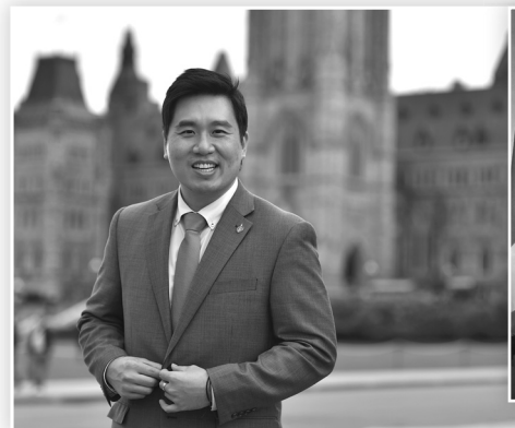
國會山前留影 In front of the Parliament Hill