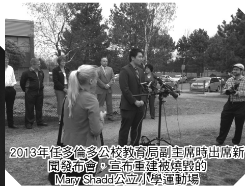
2013年任多倫多公校教育局副主席時出席新聞發布會，宣布重建被燒毀的Mary Shadd公立小學運動場 As Vice-Chair and Trustee of TDSB at a Press conference for the rebuilding of Mary Shadd Public School's playground after it was burnt down by fire (2013)