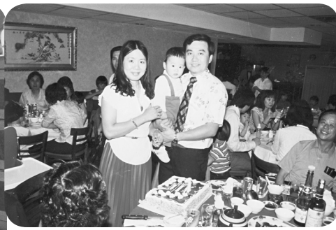
滿周歲時與父母合影 With his parents at first birthday