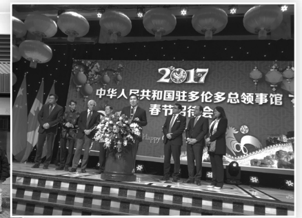
出席2017年中國駐多倫多總領館春節招待會 Attending 2017 Chinese New Year celebration