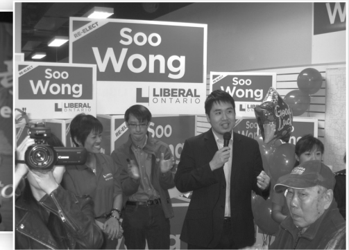
參加集會支持省議員黃素梅連任競選 Rallying for support for MPP Soo Wong