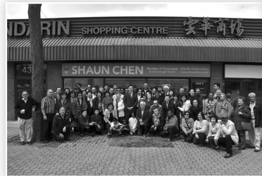
選區辦公室開放日 Open House of Constituency Office