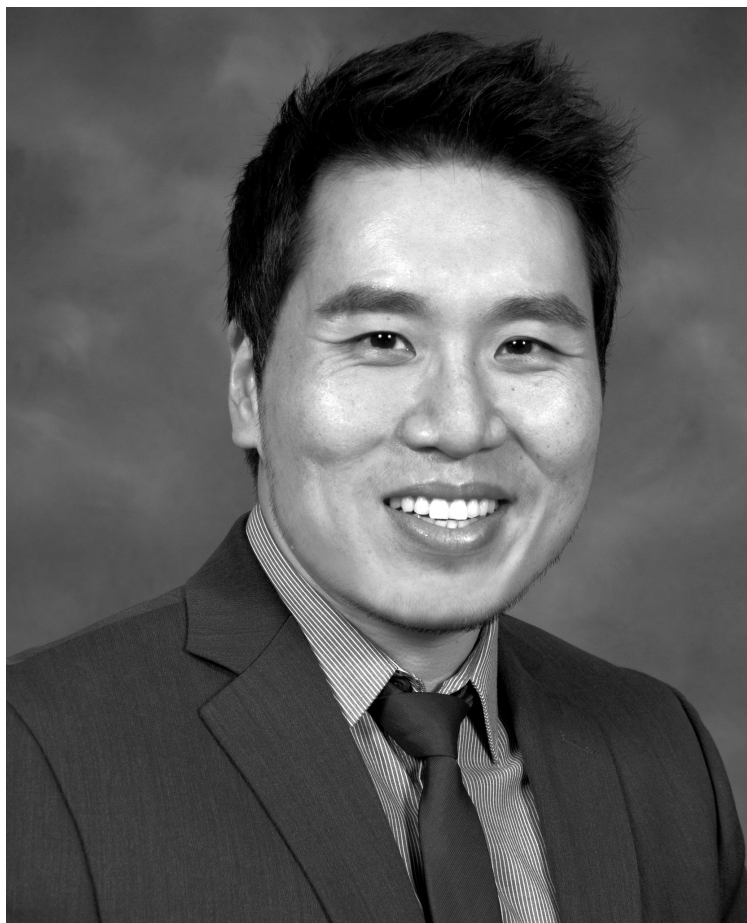
陳聖源 議員 Shaun Chen, MP