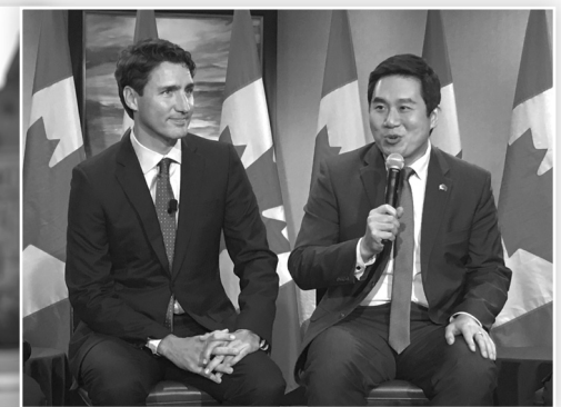
與賈斯汀特魯多總理（右）合影 With Prime Minister, the Right Honourable Justin Trudeau