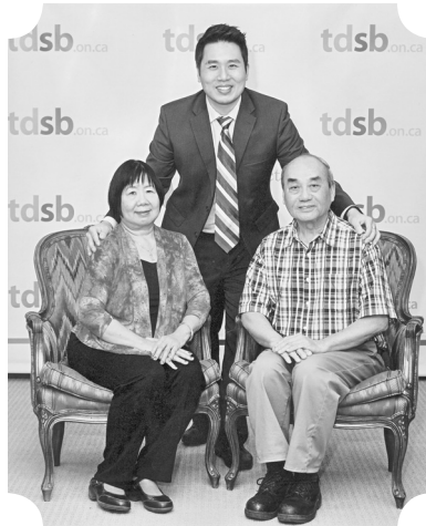
2014年被選為多倫多公校教育局主席後與父母合影 Named Chair of Toronto District School Board (TDSB) in 2014. A photo with parents.