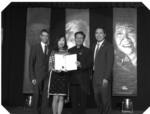
和陳家諾議員出席多倫多史維會活動 With MP Arnold Chan at ALPHA Education fundraising gala