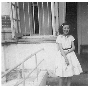
聖保祿天主教小學六年級 St. Paul's Primary Catholic School - Grade 6