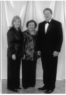
與前紐約市長Rudolph Guiliani (2002)；與前美國總統Bill Clinton (2004)； 與前美國副總統伉儷 Al & Tipper Gore (2005) An Evening with Rudolph Guiliani (2002), with Bill Clinton (2004), with Al & Tipper Gore (2005)