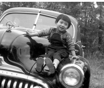
四歲大 At 4 years old