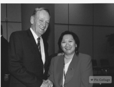
聯邦自由黨晚宴 (2000) Confederation Dinner (2000)