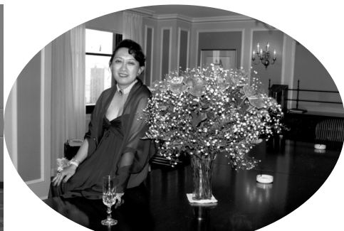
在費爾蒙皇家約克酒店歡度“四十大壽” (1991) “Big 40” at the Fairmont Royal York (1991)