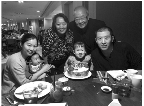
全家福 - 兒媳和孫兒 (2014)