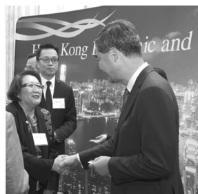
「邁向亞洲 首選香港」研討會, 香港特首梁振英到訪 (2015); 加中貿易理事會接待國家主席胡錦濤。 With Chief Executive the Hon. C. Y. Leung (2015); President Hu Jintao, People's Republic of China