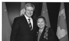
加中貿易理事會在廣 州 (2013) Canada China Business Council event at Guangzhou (2013)