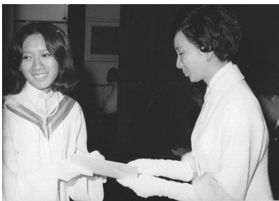
聖保祿學校畢業典禮 (1969) St. Paul's Convent School-Speech Day (1969)