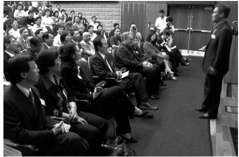
應邀在CPAC演講，分享創業心得。