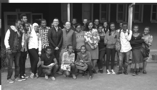
與埃塞俄比亞Addis Ababa 大學牙醫學生 With the dental students of Addis Ababa University in Ethiopia