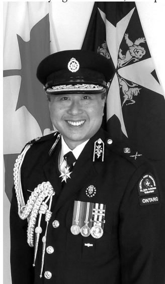
現任聖約翰救護機構的安省總監 As the Provincial Commissioner of St. John Ambulance Ontario