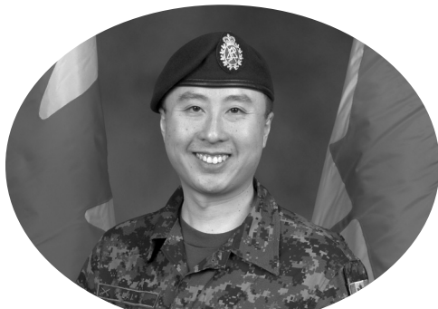
加入加拿大國家後備軍,在軍中專治牙周病 Serving as a Dental Officer Reservist in the Royal Canadian Dental Corps