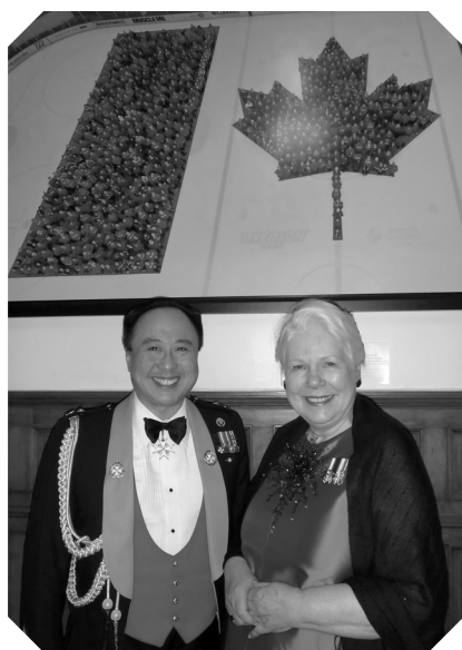
擔任安省省督Honourable Elizabeth Dowdeswell 的副官 As an Aide de Camp to the Lieutenant Governor of Ontario, The Honourable Elizabeth Dowdeswell