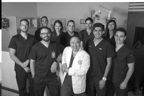
與牙周病科實習牙醫一起 With Graduate Periodontal Residents