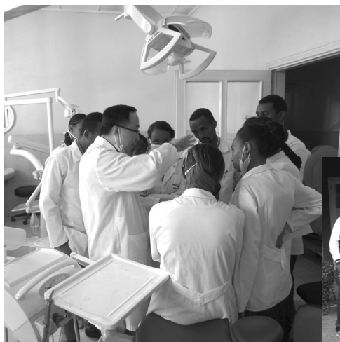
在Addis Ababa大學教授牙周病學 Teaching Periodontics in the Addis Ababa University Dental Clinic