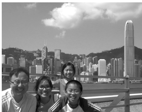
與家人在香港 Spending time in Hong Kong with family