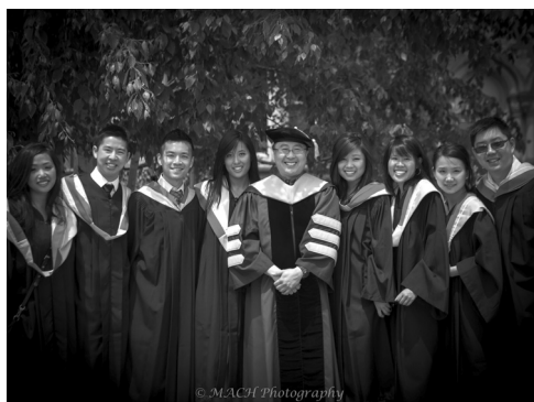
多倫多大學畢業禮 University of Toronto Convocation with dental students