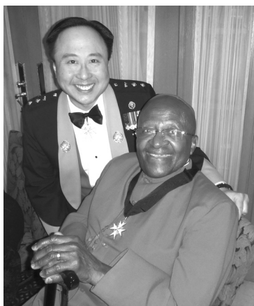
與諾貝爾獎得主南非聖約翰大主教 Desmond Tutu合照