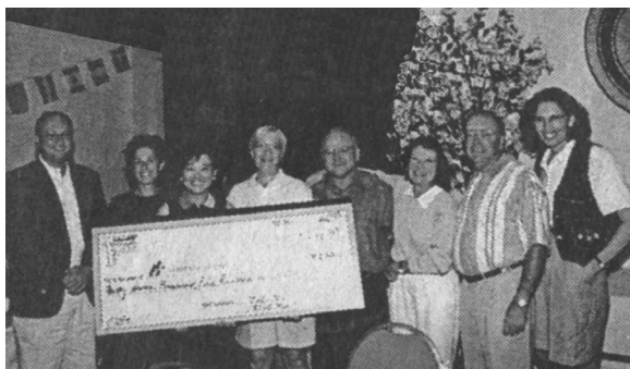
為The Marvell Koffler Breast Centre, Mount Sinai Hospital籌款