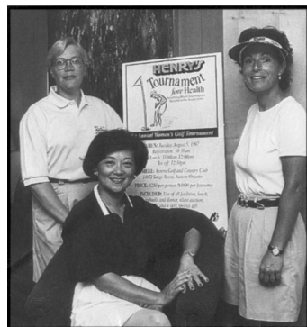
1998擔任西乃山醫院(Mount Sinai Hospital)的女子高爾夫 球慈善比賽的共同主席